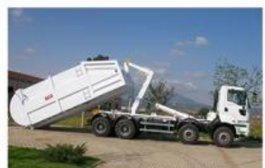
FORK LIFTING TRUCK