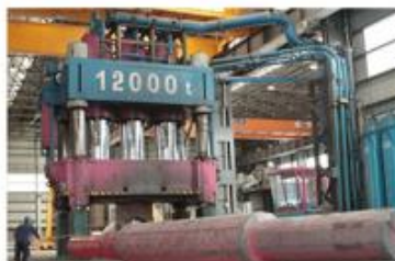
12000TON FORGING PRESS