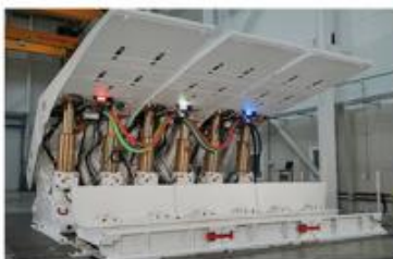
HYDRAULIC JACKING PLATFORM