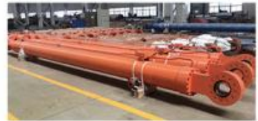
DAM GATE LIFT CYLINDER