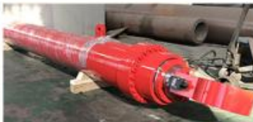
DOUBLE ACTING TELESCOPIC CYLINDER