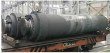
4000TON PRESS CYLINDER