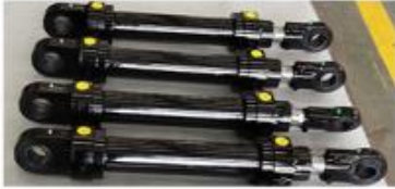
STEEL MILL CYLINDER