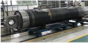
OFFSHORE OIL RIG CYLINDER