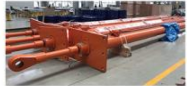
INLET GATE CYLINDER