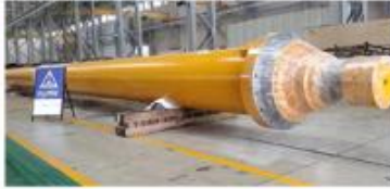
1000TON DRAW BENCH CYLINDER