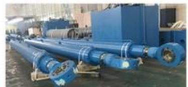
HYDRAULIC HOIST SYSTEM