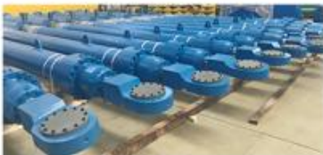
HYDROPOWER PLANT CYLINDER