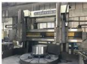
6.HEAVY VERTICAL LATHE