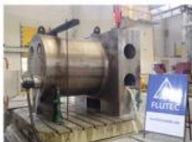
5.FLOOR BORING MACHINE