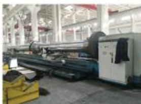
17. HEAVY LATHE