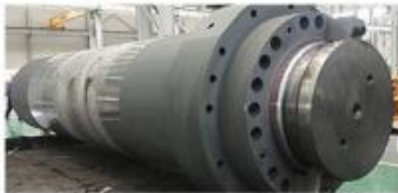
HYDRAULIC PRESS CYLINDER