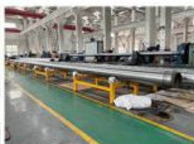
15. OUTSIDE HONING