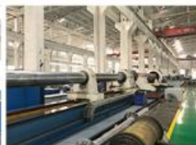
8. LARGE DEEP HOLE BORING