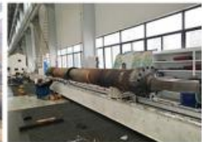
20. ASSEMBLY BENCH