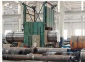
10. HEAT TREATMENT AFTER WELDING