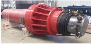
STEEL MILL CYLINDER