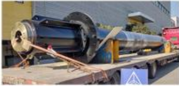
INNER GUIDING CYLINDER