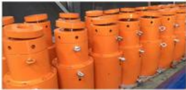
HYDRAULIC JACKING CYLINDER