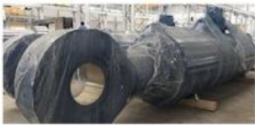
SPLIT HOPPER CYLINDER