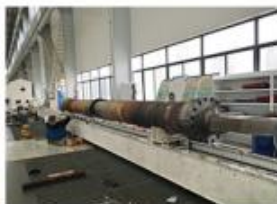
20. ASSEMBLY BENCH