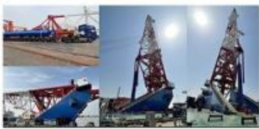
LUFFING CYLINDER FOR PILING BARGE