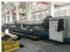
17. HEAVY LATHE