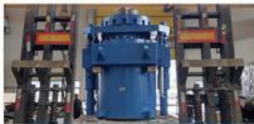
PLATE FLATTING MACHINE