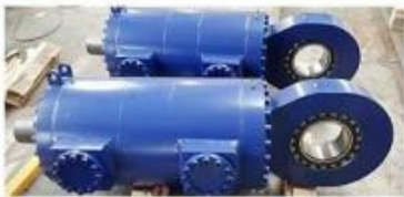
CEMENT CRUSHER CYLINDER