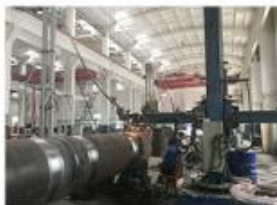
9. SUBMERGED ARC WELDING