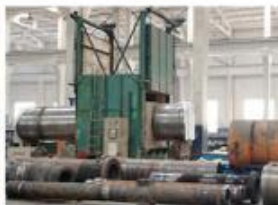
10. HEAT TREATMENT AFTER WELDING