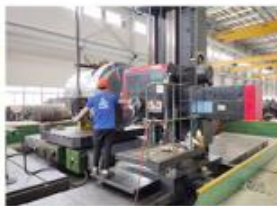
4. FLOOR DRILLING