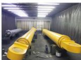
22. PAINTING BOOTH