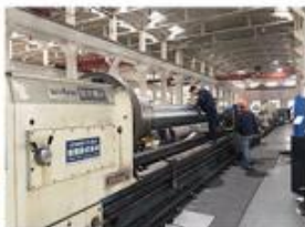
11. LARGE LATHE