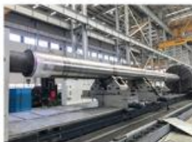
12. LARGE LATHE