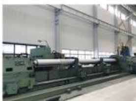
13. LARGE GRINDING