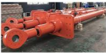
DAM GATE CYLINDER