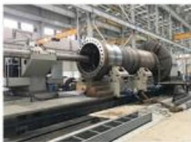
3. HEAVY CNC MACHINE