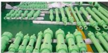
STANDARD SERIES CYLINDERS