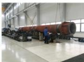
14. DEEP HOLE HONING