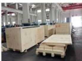
23. SEAWORTHY PACKING