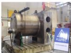
5. FLOOR BORING MACHINE