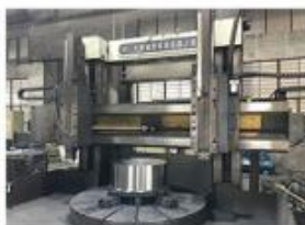
6. HEAVY VERTICAL LATHE