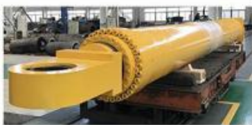
SHIP CRANE CYLINDER