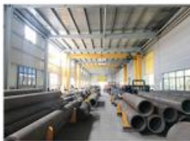
1. RAW MATERIAL WAREHOUSE