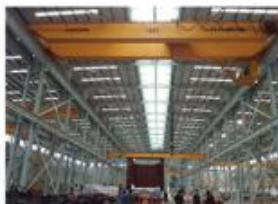
18. 100TON BRIDGE CRANE