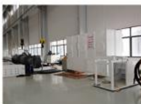
21. PRESSURE TEST BENCH