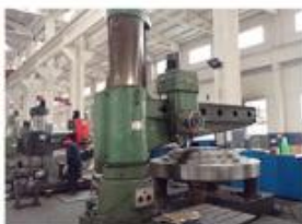
7. HEAVY DRILLING