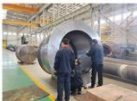
19. INSPECTION ONSITE