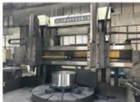
6.HEAVY VERTICAL LATHE