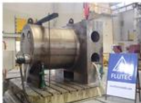
5.FLOOR BORING MACHINE