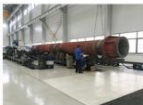
14.DEEP HOLE HONING