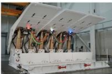
HYDRAULIC JACKING PLATFORM