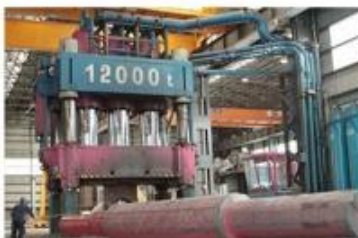
12000TON FORGING PRESS