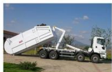
FORK LIFTING TRUCK