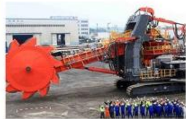
BUCKET WHEEL RECLAIMER