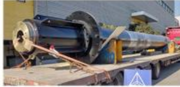
INNER GUIDING CYLINDER