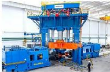
DEEP DRAW PRESS MACHINE