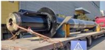
INNER GUIDING CYLINDER