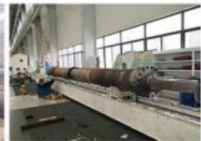
20. ASSEMBLY BENCH