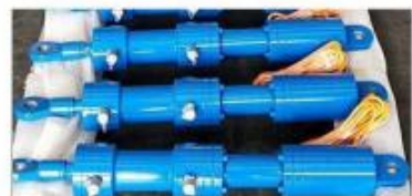
STEEL INDUSTRY CYLINDER