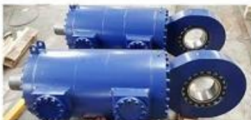
CEMENT CRUSHER CYLINDER