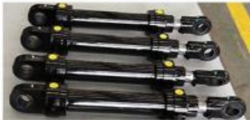
STEEL MILL CYLINDER