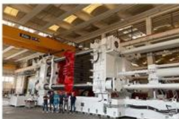
HEAVY EXTRUSION PRESS