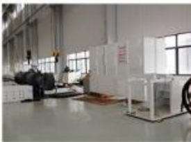
21. PRESSURE TEST BENCH