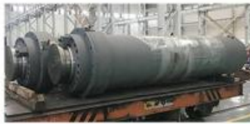
4000TON PRESS CYLINDER