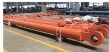
DAM GATE LIFT CYLINDER