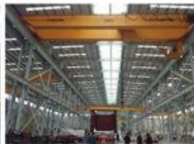
18. 100TON BRIDGE CRANE