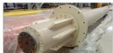
ALUMINIUM CASTING CYLINDER