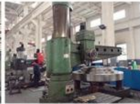
7. HEAVY DRILLING