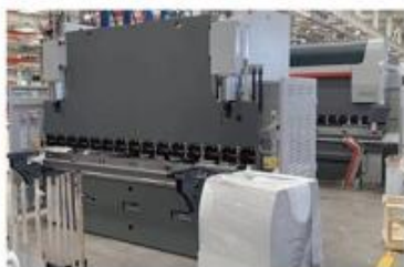
HYDRAULIC BRAKE PRESS