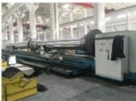
17. HEAVY LATHE