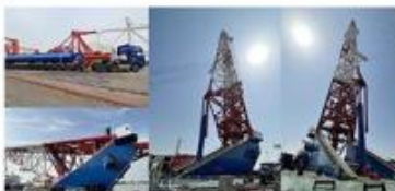
PILEING BARGE CYLINDER