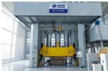
4000TON HYDRAULIC PRESS