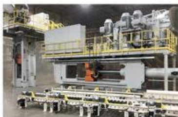
550TON EXTRUSION MACHINE