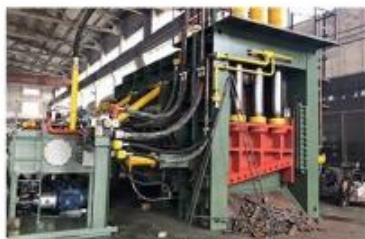
METAL SCRAP SHEAR