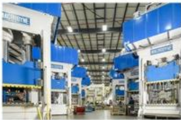
HYDRAULIC FORGING PRESS