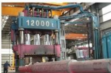
12000TON FORGING PRESS