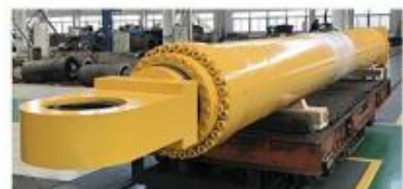
SHIP CRANE CYLINDER