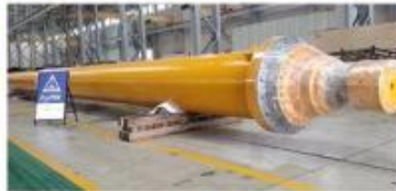
1000TON DRAW BENCH CYLINDER