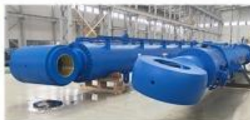
PILEING BARGE CYLINDER