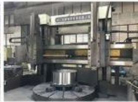
6. HEAVY VERTICAL LATHE