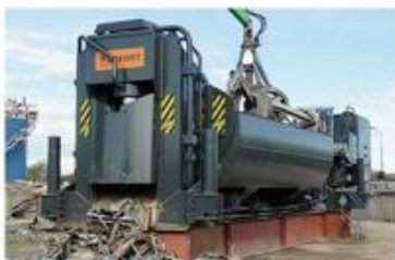
METAL SHEARING MACHINE