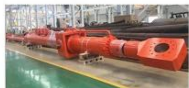
DAM GATE CYLINDER