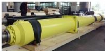
HYDRAULIC BALER CYLINDER