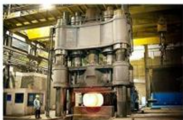
12000TON FORGING PRESS