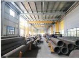
1. RAW MATERIAL WAREHOUSE