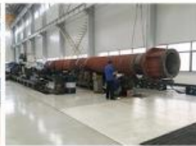
14. DEEP HOLE HONING