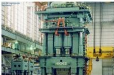
5000TON HYDRAULIC PRESS