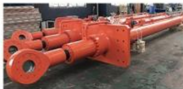
DAM GATE CYLINDER