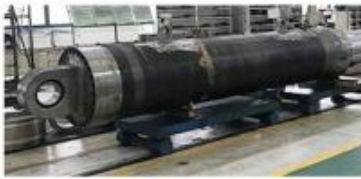
OFFSHORE OIL RIG CYLINDER