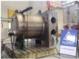
5. FLOOR BORING MACHINE