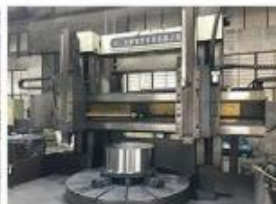
6. HEAVY VERTICAL LATHE