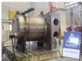
5. FLOOR BORING MACHINE