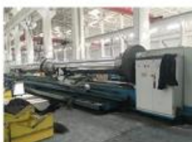
17. HEAVY LATHE