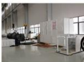
21. PRESSURE TEST BENCH