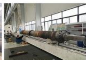
20. ASSEMBLY BENCH