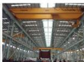
18. 100TON BRIDGE CRANE