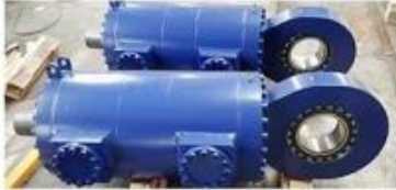
CEMENT CRUSHER CYLINDER