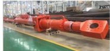
DAM GATE CYLINDER