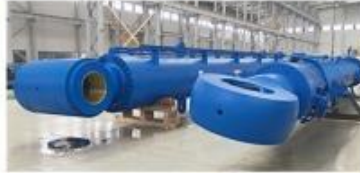
PILING BARGE CYLINDER