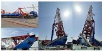
PILING BARGE CYLINDER