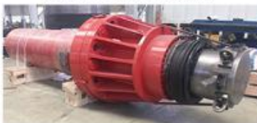
STEEL MILL CYLINDER