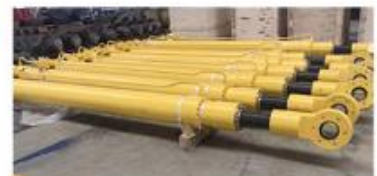
SPILLWAY GATE CYLINDER