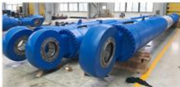
HYDROPOWER PLANT CYLINDER