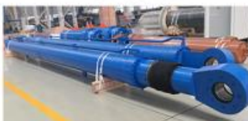
DAM GATE CYLINDER