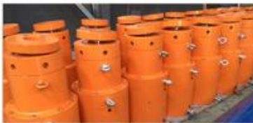
HYDRAULIC JACKING CYLINDER