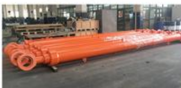
SPILLWAY GATE CYLINDER