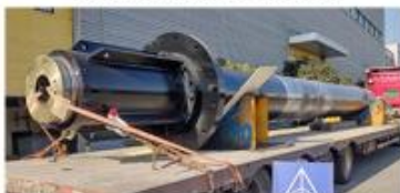
INNER GUIDING CYLINDER