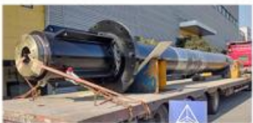
INNER GUIDING CYLINDER