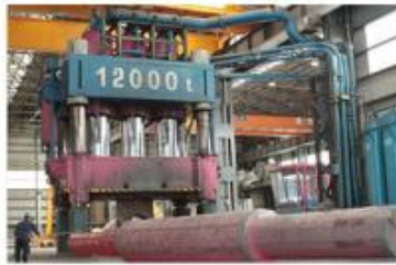
12000TON FORGING PRESS