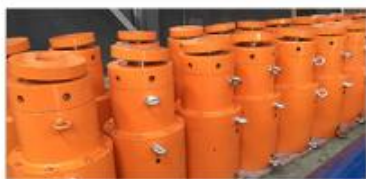
HYDRAULIC JACKING CYLINDER