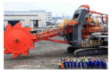
BUCKET WHEEL RECLAIMER