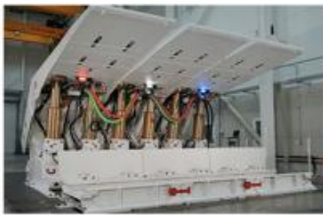
HYDRAULIC JACKING PLATFORM