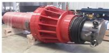
STEEL MILL CYLINDER