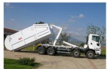
FORK LIFTING TRUCK