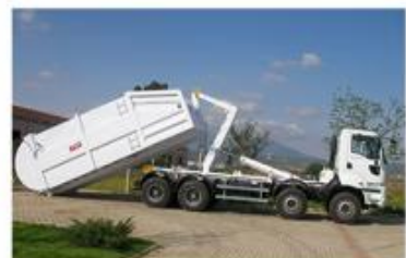
FORK LIFTING TRUCK