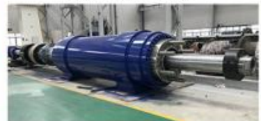
ALUMINIUM PLATE STRETCH CYLINDER