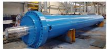
1500TON DRAW BENCH CYLINDER