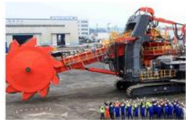
BUCKET WHEEL RECLAIMER