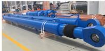
DAM GATE CYLINDER