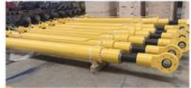
SPILLWAY GATE CYLINDER