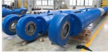
HYDROPOWER PLANT CYLINDER