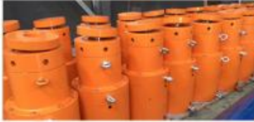
HYDRAULIC JACKING CYLINDER