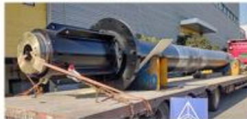
INNER GUIDING CYLINDER