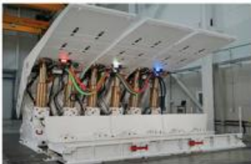
HYDRAULIC JACKING PLATFORM