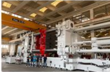
HEAVY EXTRUSION PRESS