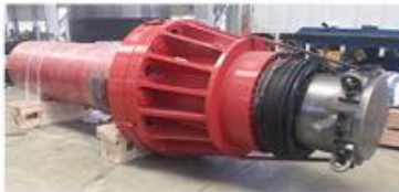
STEEL MILL CYLINDER