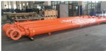
SPILLWAY GATE CYLINDER