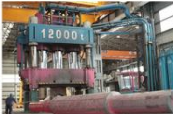
12000TON FORGING PRESS