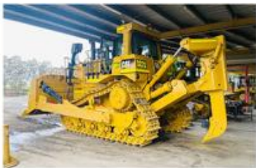
CIVIL ENGINEERING MACHINE