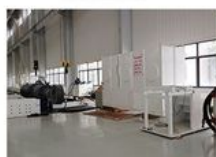
21. PRESSURE TEST BENCH