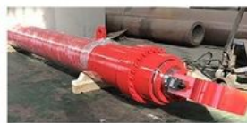
DOUBLE ACTING TELESCOPIC CYLINDER