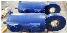
CEMENT CRUSHER CYLINDER