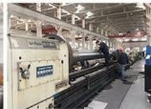
11. LARGE LATHE