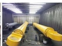
22. PAINTING BOOTH