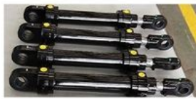
STEEL MILL CYLINDER