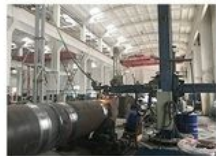
9. SUBMERGED ARC WELDING