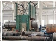
10. HEAT TREATMENT AFTER WELDING