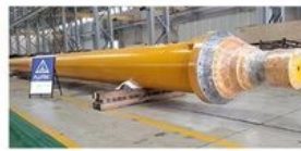
1000TON DRAW BENCH CYLINDER