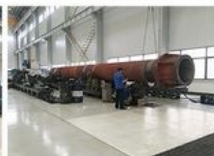
14. DEEP HOLE HONING