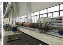
20. ASSEMBLY BENCH