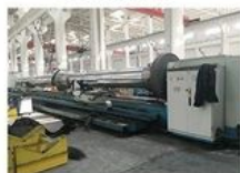
17. HEAVY LATHE