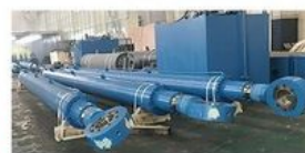
HYDRAULIC HOIST SYSTEM