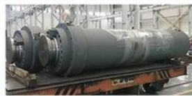
4000TON PRESS CYLINDER