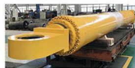
SHIP CRANE CYLINDER