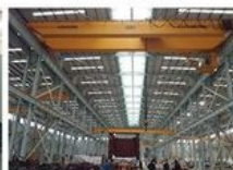
18. 100TON BRIDGE CRANE