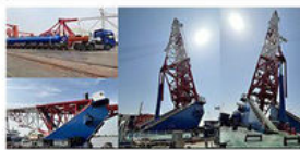
LUFFING CYLINDER FOR PILING BARGE