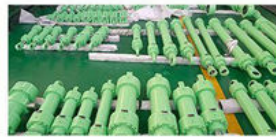
STANDARD SERIES CYLINDERS