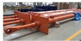
INLET GATE CYLINDER