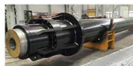
ALUMINIUM CASTING CYLINDER