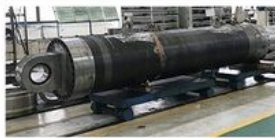
OFFSHORE OIL RIG CYLINDER