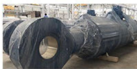
SPLIT HOPPER CYLINDER