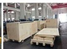
23. SEAWORTHY PACKING