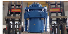
PLATE FLATTING MACHINE