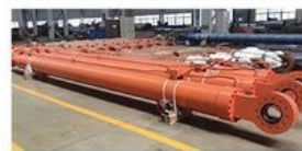
DAM GATE LIFT CYLINDER