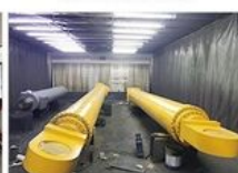
22. PAINTING BOOTH