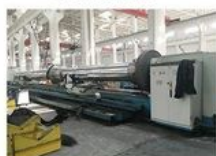
17. HEAVY LATHE