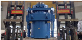
PLATE FLATTING MACHINE