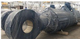
SPLIT HOPPER CYLINDER