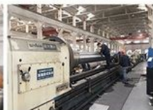
11. LARGE LATHE