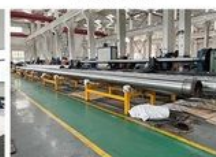
15. OUTSIDE HONING