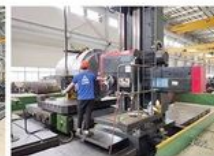
4. FLOOR DRILLING