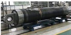
OFFSHORE OIL RIG CYLINDER