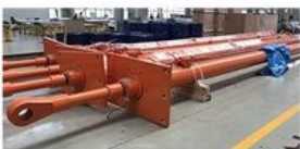
INLET GATE CYLINDER