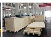
23. SEAWORTHY PACKING