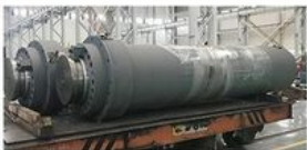
4000TON PRESS CYLINDER