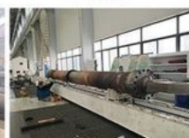
20. ASSEMBLY BENCH