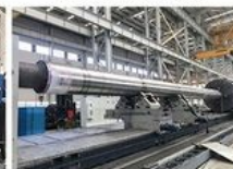
12. LARGE LATHE