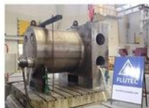
5. FLOOR BORING MACHINE