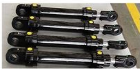
STEEL MILL CYLINDER