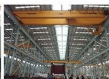
18. 100TON BRIDGE CRANE