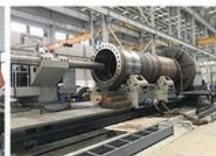
3. HEAVY CNC MACHINE