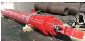
DOUBLE ACTING TELESCOPIC CYLINDER