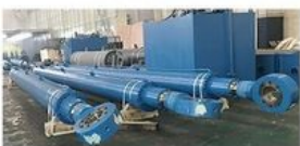
HYDRAULIC HOIST SYSTEM