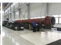
14. DEEP HOLE HONING