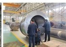
19. INSPECTION ONSITE