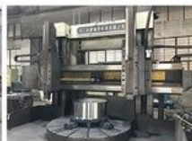
6. HEAVY VERTICAL LATHE