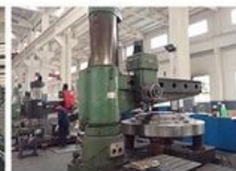
7. HEAVY DRILLING