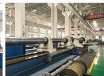
8. LARGE DEEP HOLE BORING