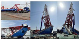
LUFFING CYLINDER FOR PILING BARGE