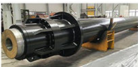
ALUMINIUM CASTING CYLINDER