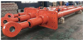
DAM GATE CYLINDER