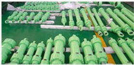
STANDARD SERIES CYLINDERS