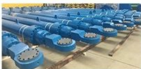
HYDROPOWER PLANT CYLINDER