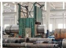
10. HEAT TREATMENT AFTER WELDING