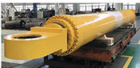
SHIP CRANE CYLINDER