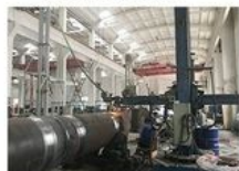
9. SUBMERGED ARC WELDING