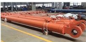
DAM GATE LIFT CYLINDER