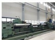
13. LARGE GRINDING