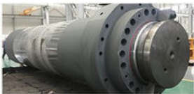
HYDRAULIC PRESS CYLINDER