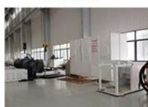
21. PRESSURE TEST BENCH