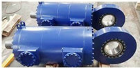
CEMENT CRUSHER CYLINDER