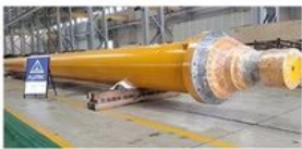
1000TON DRAW BENCH CYLINDER