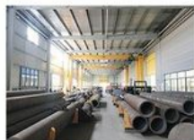
1. RAW MATERIAL WAREHOUSE